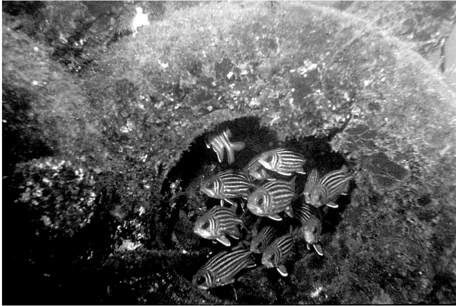
FIG. 2. – Red squirrelfish in the artificial reef complex in the south-eastern Mediterranean (Reduced to 23.4 % of the original size).

age of 3.65 kg per census (50.9 % of the estimated total biomass of large fish in the reefs) in 1985-86 to an average of 7.96 kg per census (87.5 %) in 1995. This change is due mainly to the increase in the number of Red Squirrel fish, Sargocentron rubrum (Forsskål) in the artificial reefs (Fig. 2), with a corresponding decrease in the number of indigenous groupers and Mediterranean sparids (Table 2). There was an 8.1% increase in the total number of large fish (and the total estimated biomass) in the artificial reef complex over the decade (Table 2).