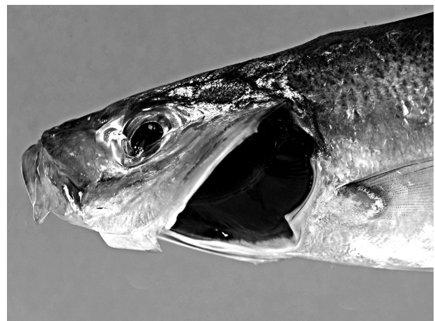
FIG. 2. – Shoulder girdle (cleithrum) of Decapterus russelli (154 mm SL) from Haifa Bay, Israel, showing the two papillae.

Decapterus russelli has a wide Indo-Pacific distribution from the Red Sea and east Africa to Japan and Australia (Smith-Vaniz, 1984). It was recorded from the Gulf of Suez by several authors (Rüppell, 1830; Norman, 1935) as Caranx russelli and as Decapterus kiliche by Bertin and Dollfus (1948) and Demidov and Viskrebentsev (1970). Steinitz (1927) reported Caranx kiliche Cuvier and Valenciennes 1833, which is now considered as a junior synonym, off the Mediterranean coast of Palestine/pre-state Israel; his presumed misidentification (Tortonese, 1952; Golani et al. , 2002) was repeated by several authors (see: Ben-Tuvia, 1966). Until the present report, no specimen of D. russelli had been reported in the Mediterranean.