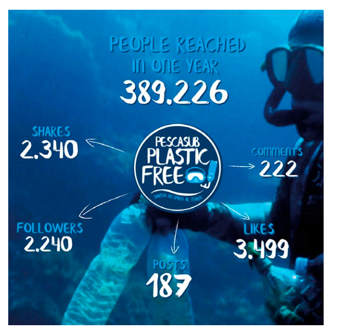
Fig. 2. – A summary of the social media impact generated by the metagroup created on Facebook by Plastic-Free Spearfishing.

In the last year Plastic-Free Spearfishing has created a metagroup on Facebook (i.e. a group created by the administrators of other groups) as well as a website (http://www.pescasubplasticfree.org). The activity of the metagroup is mainly based on posting videos and photos to increase awareness of marine plastic pollution. Overall, the metagroup reached almost 400000 people for a total of 2240 followers (Fig. 2). Moreover, they organized several actions for removal of underwater plastic debris (Fig. 3). Although the initiative started in Italy, the social media network creates international connections, and other actions of underwater plastic debris removal were organized in Spain and Tunisia (Fig. 3).