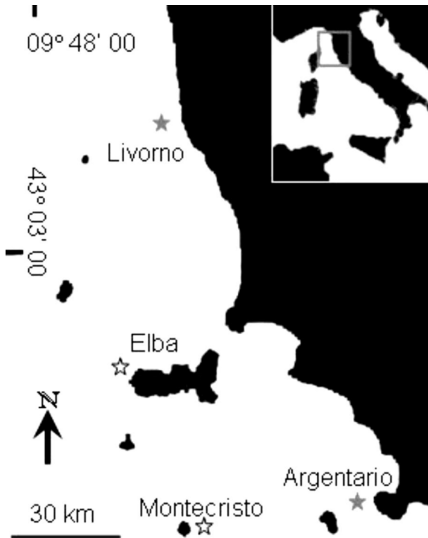
Fig. 1. – Map of the study sites. White stars, reference sites; grey stars, stressed sites.