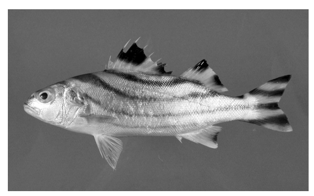
Fig. 1. – Terapon jarbua , 170 mm standard length, from Dor, Mediterranean coast of Israel, HUJ 19845.

mm (total length, 213 mm) and a weight of 120.8 g was hooked in very shallow water ( ca. 0.5 m) on the Mediterranean coast of Israel, at Dor (Tantura), ca. 25 km south of Haifa (Fig. 2). The specimen was deposited in the Hebrew University Fish Collection (HUJ) and received the catalogue number HUJ 19845.