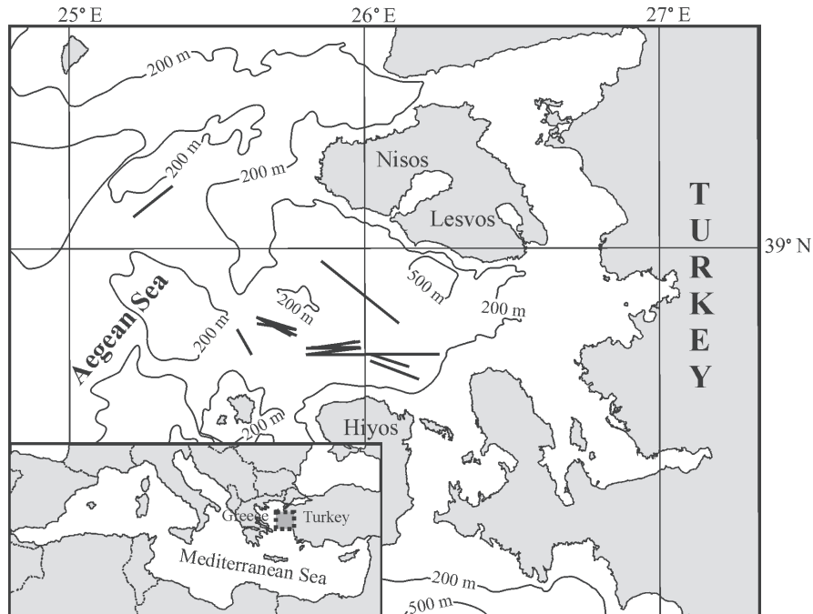
Fig. 1. – Map of the study area showing the fishing grounds of the Aegean Sea.

PE netting. The mean mesh size of each codend was measured by using a caliper rule with a 4 kg weight tied vertically to the stationary jaw of the rule.