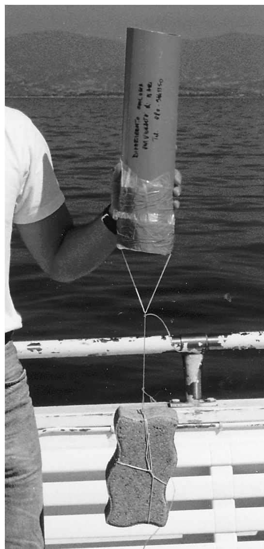
FIG. 3 – The PVC tube, 40 cm length and 10 cm in diameter, closed and ballasted at the lower end, employed for the release to deep waters.

One month after tagging, the commercial vessel “Lucia madre” recaptured one specimen (104 tag number) on 26 June 1998 at 20:00, during a haul carried out at a depth of 506 m. During its month of free life, the tagged specimen, a female, covered at least 10 nautical miles, moving north-east and to greater depths (Fig. 1).